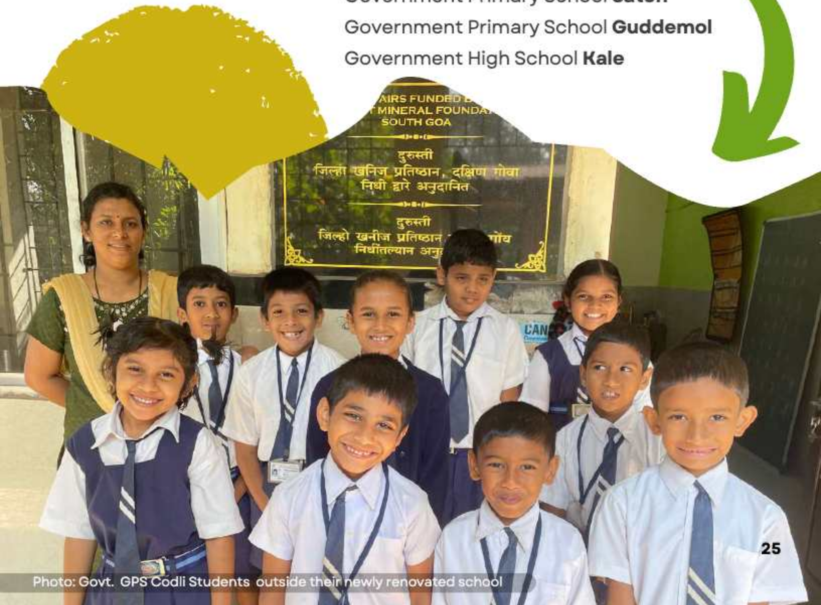
Photo: Govt. GPS Codli Students outside their newly renovated school