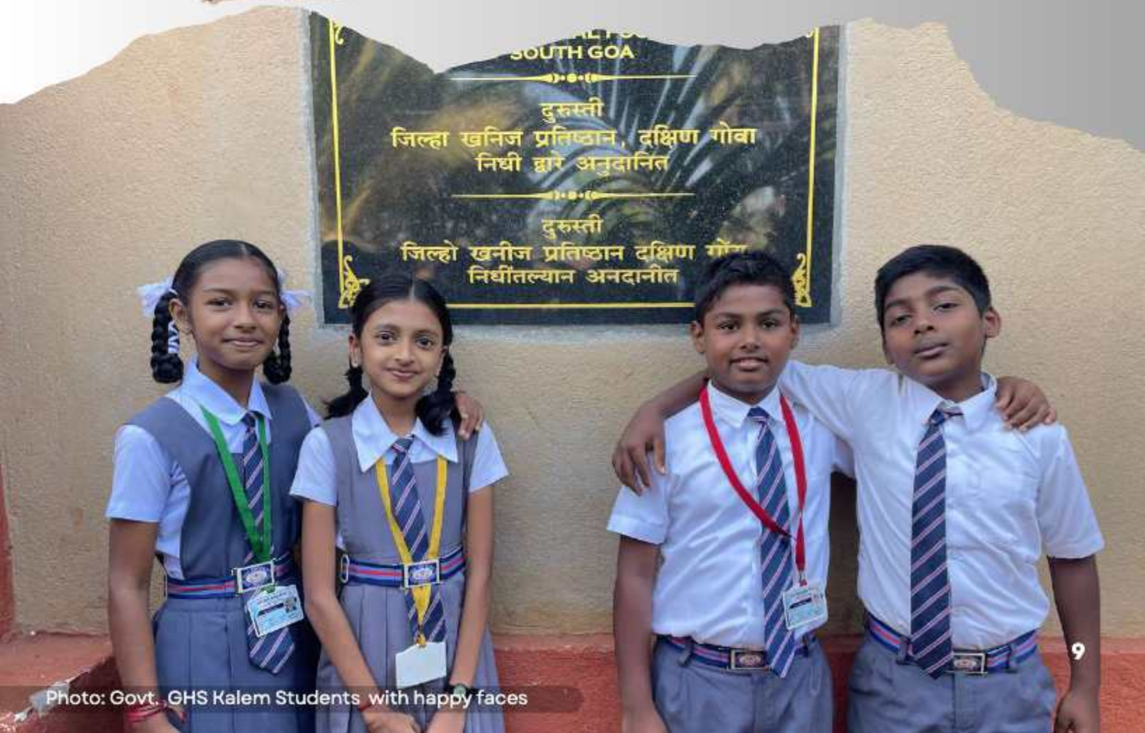
Photo: Govt. GHS Kalem Students with happy faces