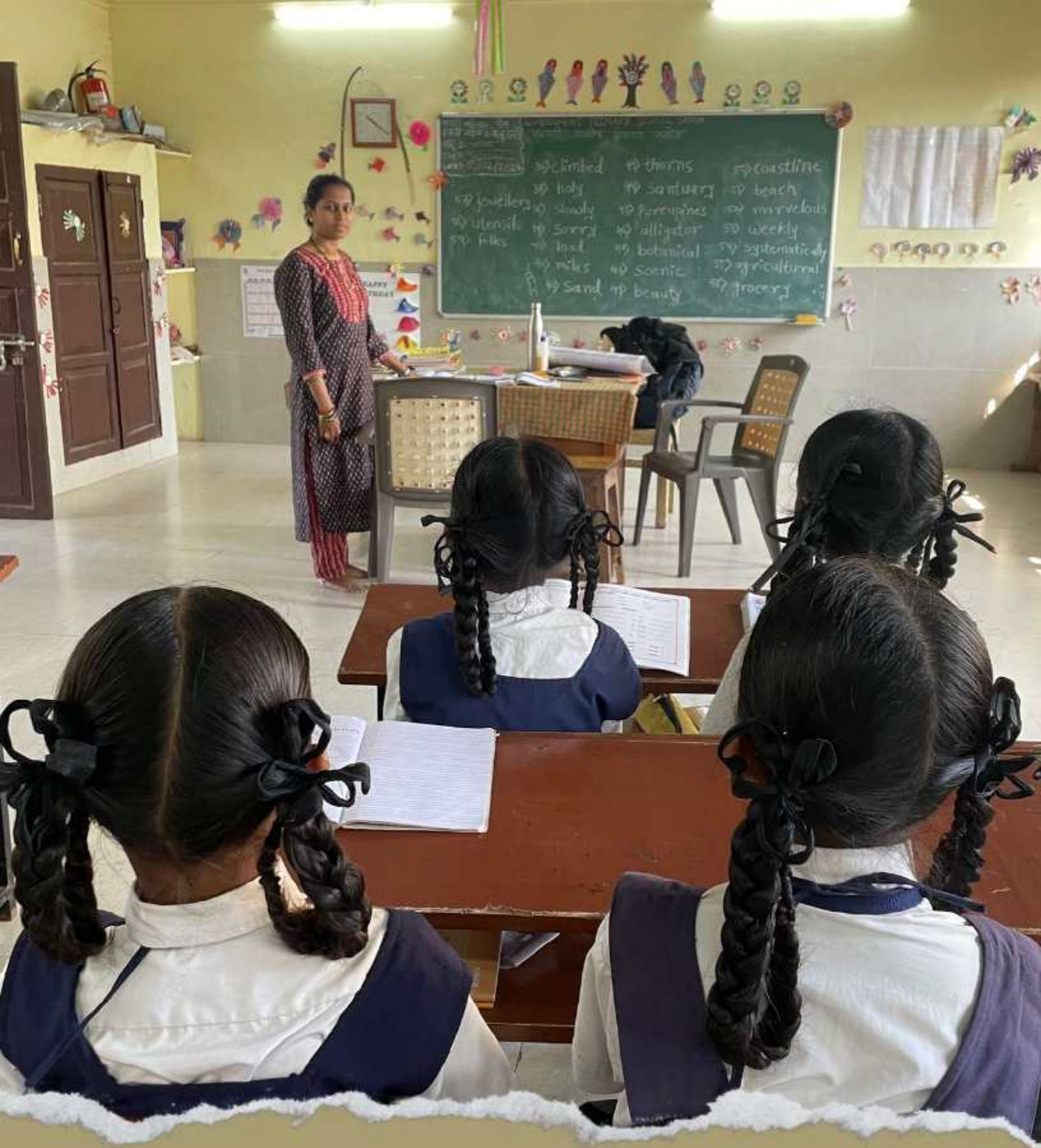
Students of Government Primary School, Saton- Goa taking class in their newly renovated school building.