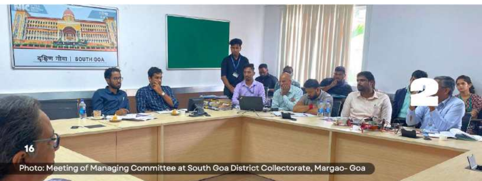
Photo: Meeting of Managing Committee at South Goa District Collectorate, Margao- Goa