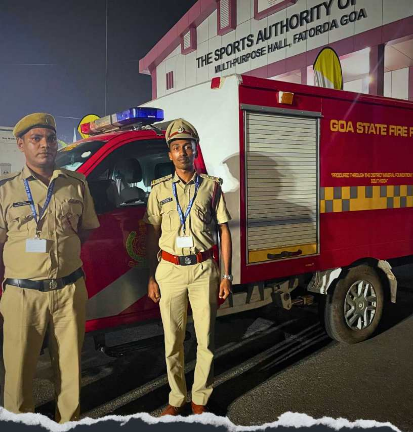
Quick response vehicle procured by SGDMF funds standby on duty