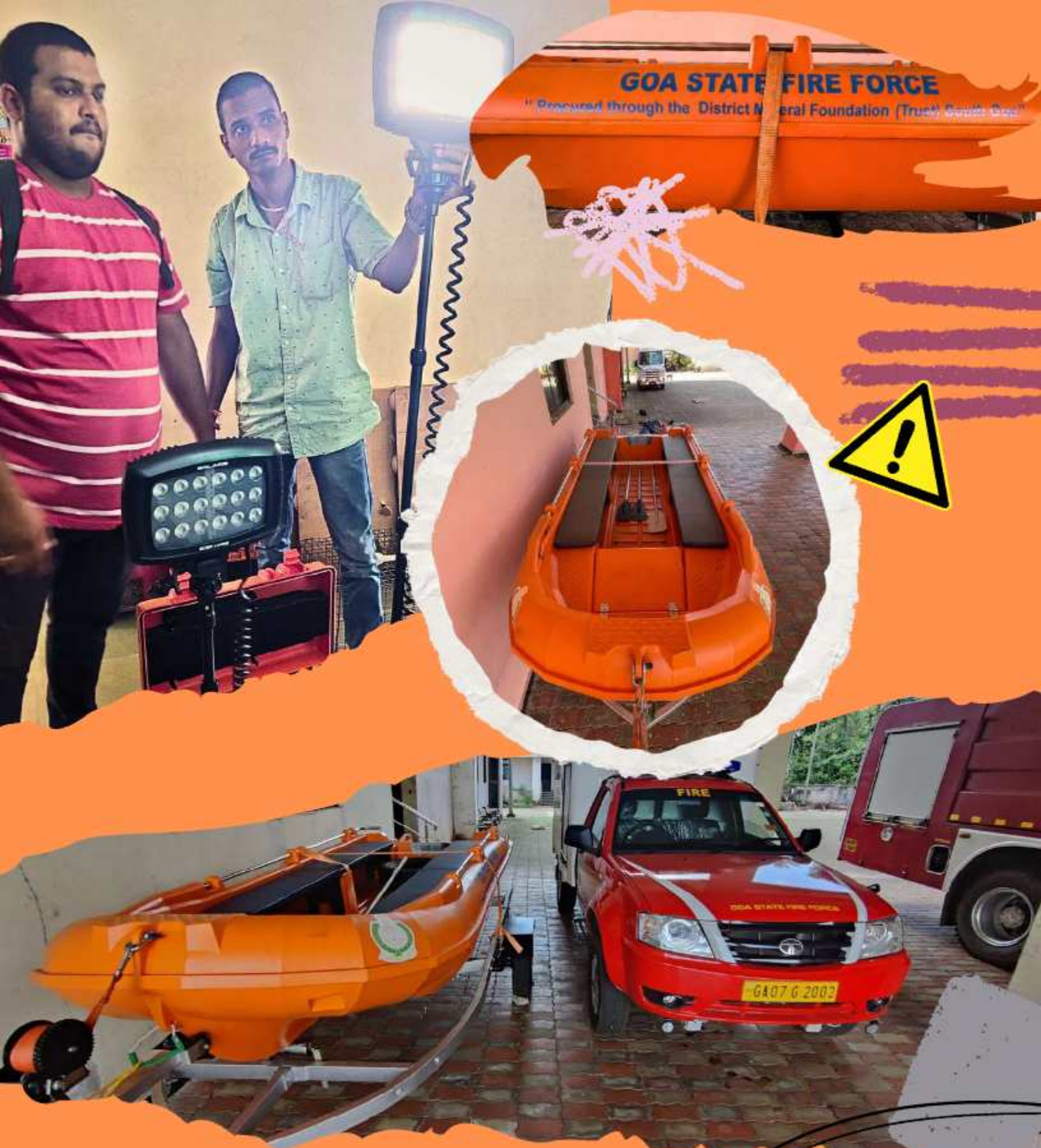
Life-Saving Boat with attachment to the Quick Response Vehicle, procured in aid of Mining affected zones of South Goa after the Cyclone Tauktae- by SGDMF